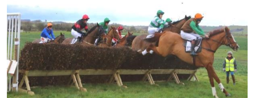
Sheriff Hutton Point-to-Point Charity Event Sunday 12 th January, 2020

Work-Shy, local band, in St Georges Church Scackleton March 2020