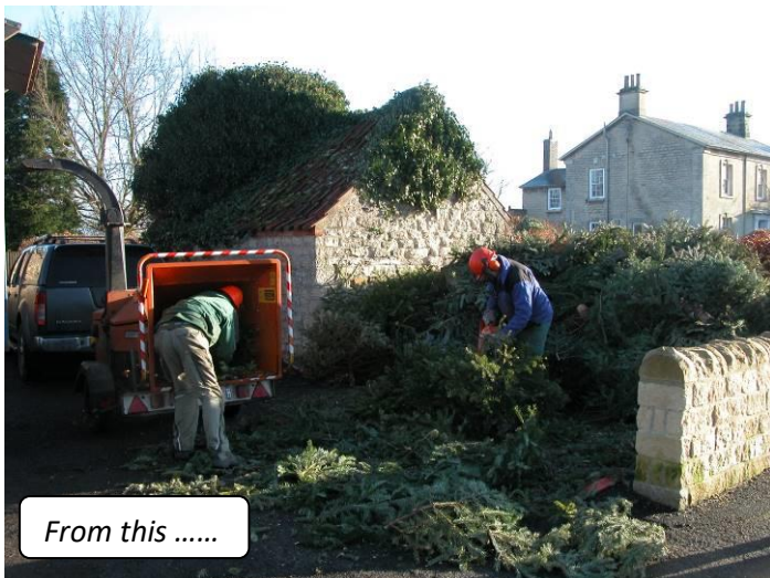
From this .....

'Thank you' to all those households that brought their Christmas Trees to the Village Hall carpark. There were over 55 trees processed into mulch within 45 minutes – mind you snow did delay proceedings for an hour.