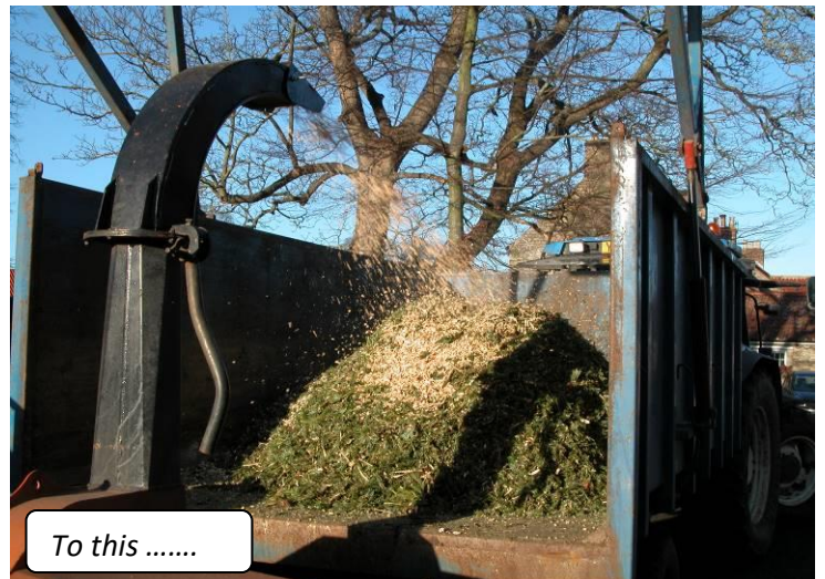
To this .....