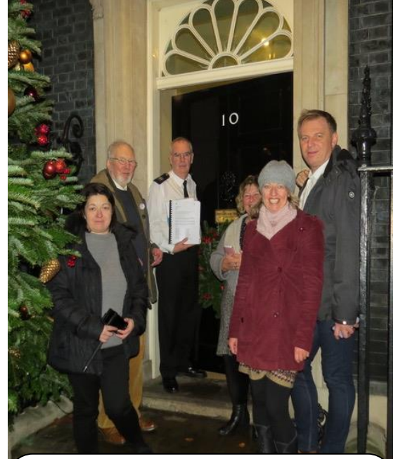
Handing in the letter to No.10 Downing Street signed by international, national, local organisations, MPs, eminent academics and individuals