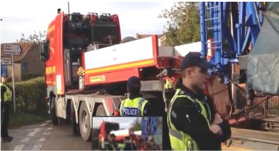
Workover rig stuck going through Kirby Misperton, Oct 2017.

Publicly Third Energy have announced that they will return. The impact for residents is that if Third Energy prepare to frack, residents will incur a repeat of the significant disruption, noise and inconvenience as the same number of HGVs will be needed to return all of the equipment back to the site for a second time.