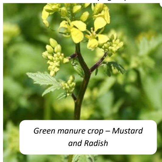
Green manure crop – Mustard and Radish