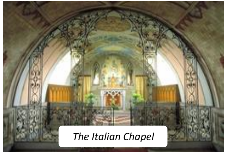
The Italian Chapel