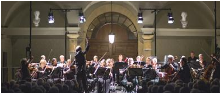
Royal Sinfonia in the Riding School