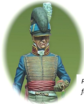
Perhaps there's time for a quick half!

Nationally the powers-that-be have decided not to mention this as it might upset the French. But, here in Hovingham, the anniversary is being celebrated with a tongue-in-cheek look at its lesser known stories. Entitled "Waterloo, not a lot of people know . . .", a display of model figures is accompanied by shocking revelations, including the amorous Wellington's highly exalted French fan club, Napoleon's career as a life model, the Russell Brand fashions followed by bold hussars and how a victory could depend on a pinch of snuff.