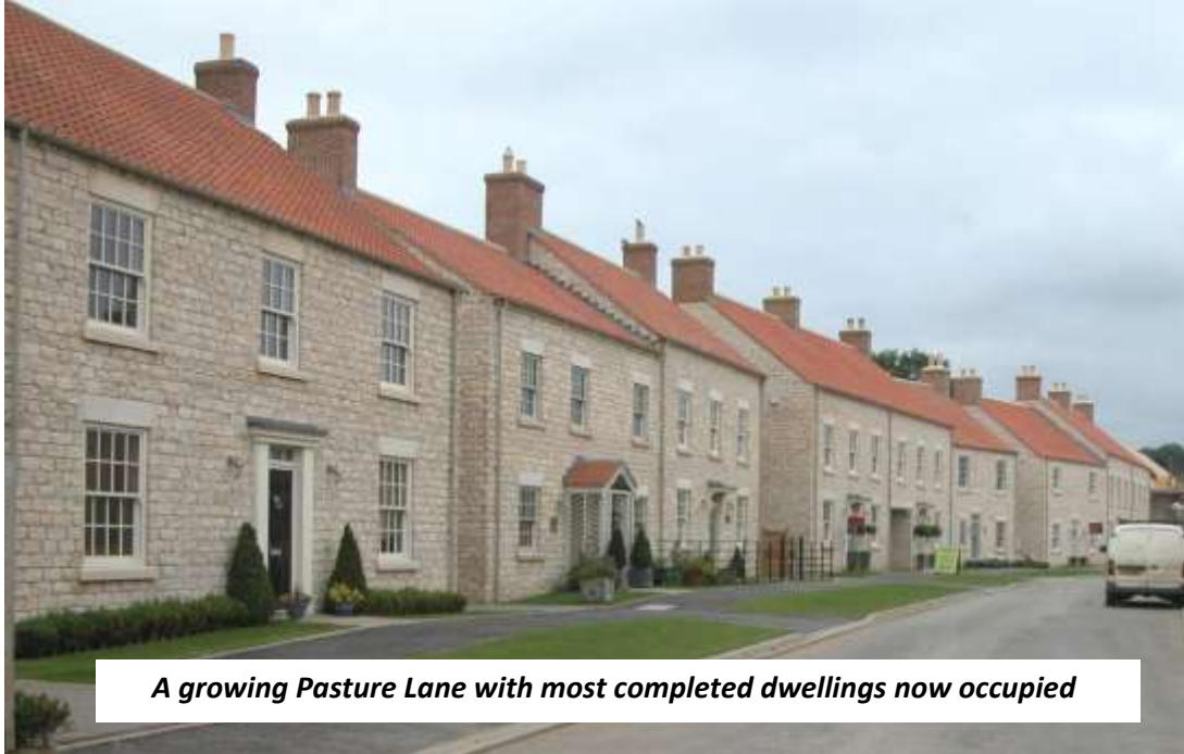
A growing Pasture Lane with most completed dwellings now occupied