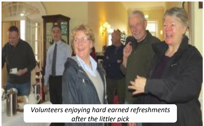
Volunteers enjoying hard earned refreshments after the litter pick