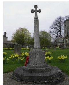
Remembering the men of Hovingham who gave their lives in two World Wars