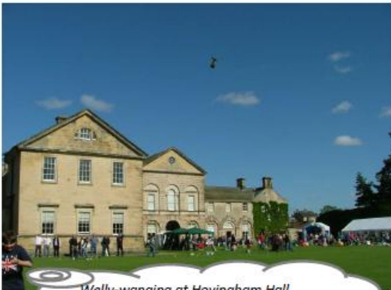
Welly-wanging at Hovingham Hall. Spot the high flying welly and the very blue sky