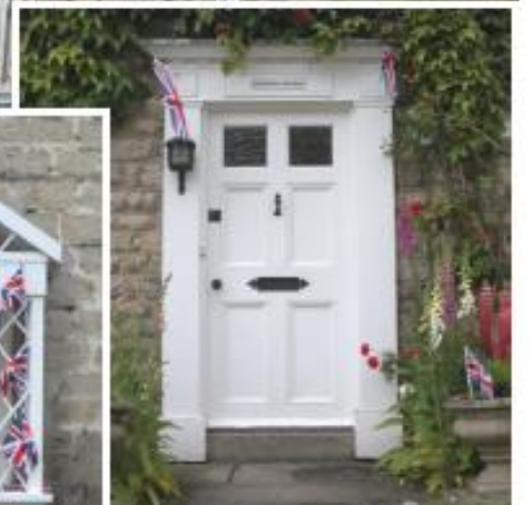
Householders fly the flag