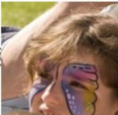
Face painting - for all ages